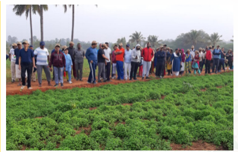
The Oasis-Gramathon participants walking through fields of green.